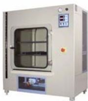
Corrosionbox 400 I