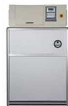
Solarbox 3000 RH

We reserve the right to make changes to equipment and systems in response to advances in technology and modify parameter values accordingly.