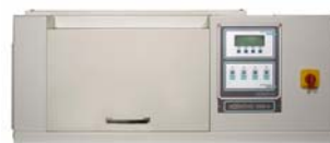
Solarbox 3000 e